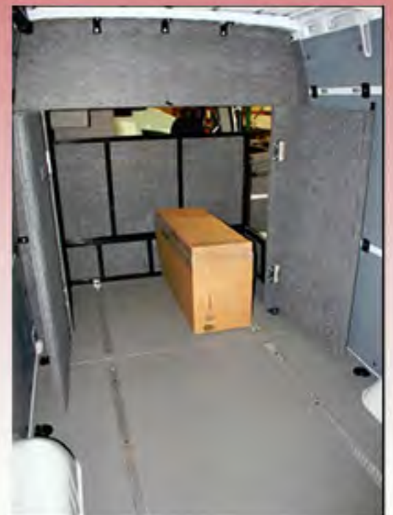
BARRIER DOORS OPEN WITH CARGO (Ultra Package)