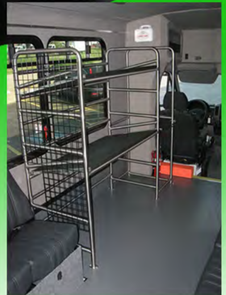
Interior Luggage Rack Shown