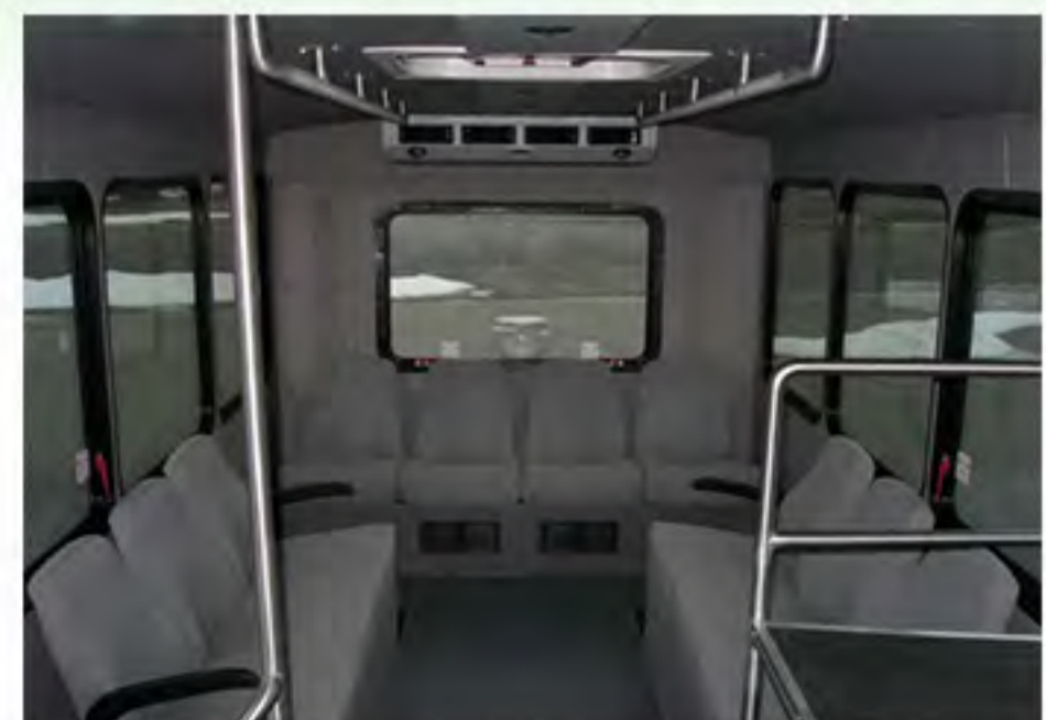
Overhead Rear Air and Grab Rails

2940 Dexter Drive Elkhart, IN 46514 (800) 505 2530 - www.mymidway.com