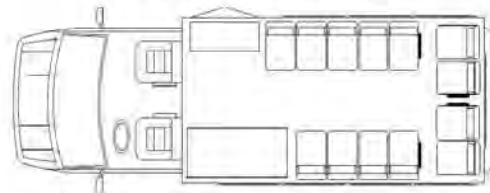
Perimeter Seating 15 Passenger