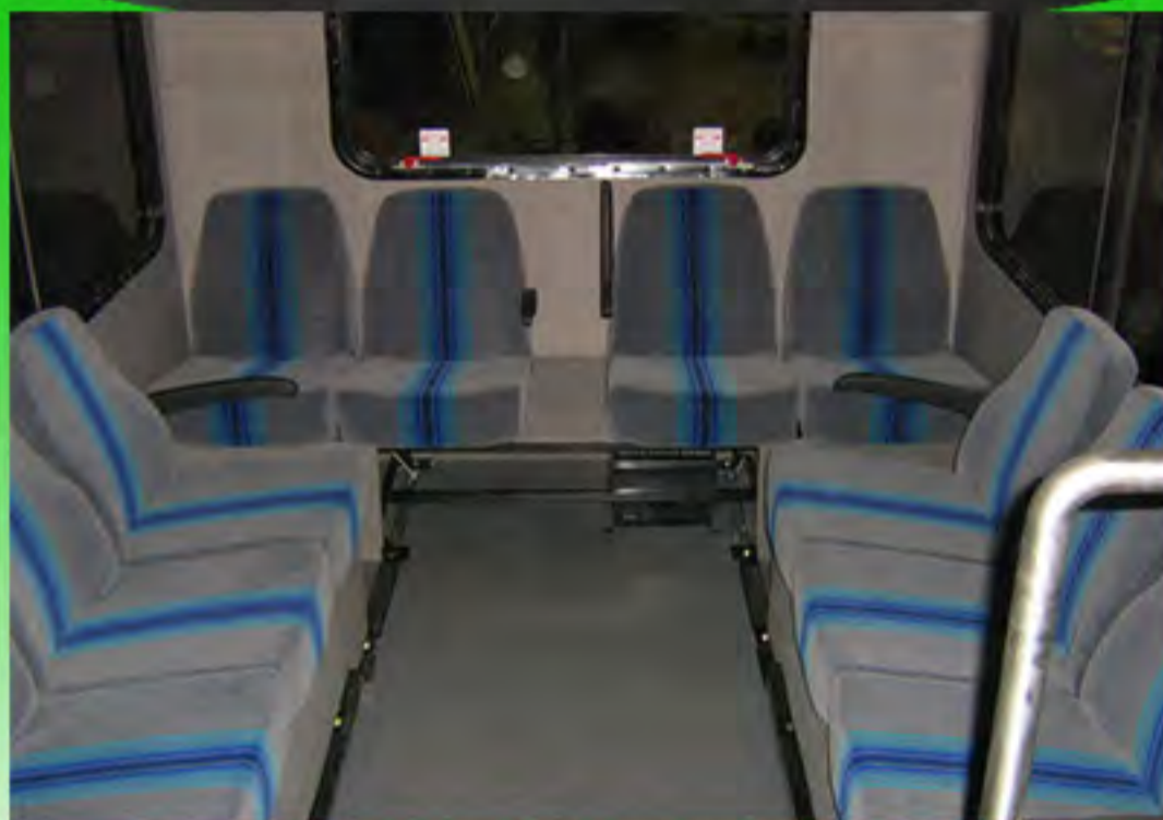
Perimeter Seating Shown