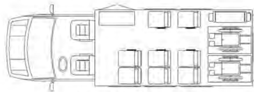
Wheelchair 12 Passenger