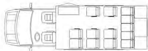
Forward Facing with Rear Luggage 15 Passenger