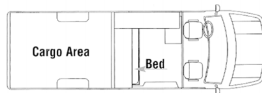
Expediter Cargo Area and Living Quarters

Midway Specialty Vehicles reserves the right to make improvements, change specifications, features, and options without notice or obligation.