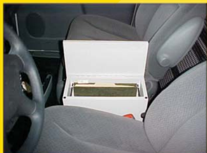
Center console literature holder