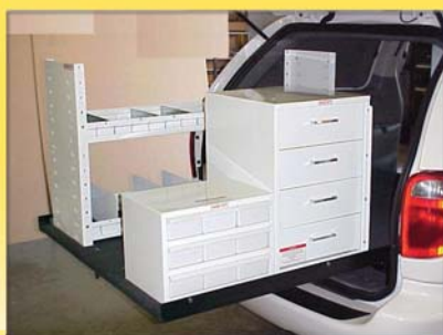
Shelving pulls out for easy access. Leave crawling on your knees in the past