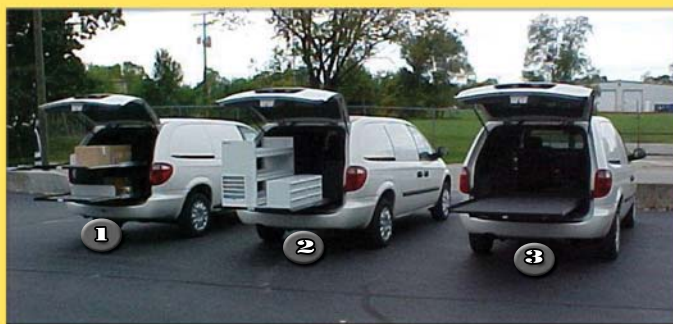
Some of the many options available are the (1) Parcel Delivery System Interior with Console, (2) Parts and Service Interior, and (3) Full Length Pull Out Shelf Delivery Interior.