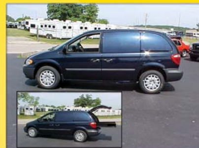
Standard Dodge Caravan CV, with our Full Length Pull Out Shelf Interior added