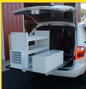
Typical metal shelf and drawer system in our Parts and Service Interior