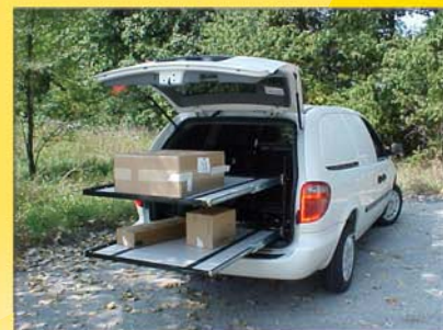
Parcel Delivery System Interior showing the double shelf parts carrying device