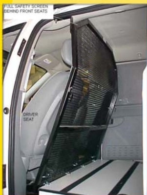
Full safety screen behind front seats