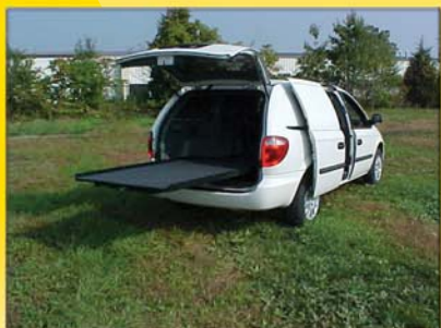
Full Length Pull Out Shelf Interior with bed drawer pulled out completely