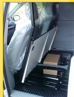
Tub for Stow 'n Go seating utilized for storage with added lift up door